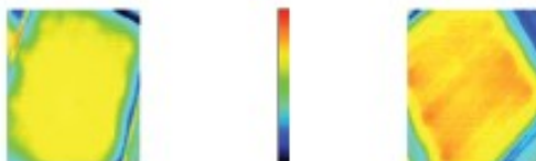
Temperature across screed surface 80 mins after turning under floor heating on

Sand Cement Surface Temperature Gyvlon Screed